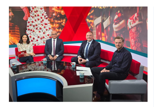
The year ended with another appearance on BBC Politics East-Mids, discussing Local Gov funding and onshore wind farms.

This year, I'm also launching a weekly newsletter, sent out every Monday evening. To make sure you receive it, please sign up at: www.craig-smith-uk/newsletter