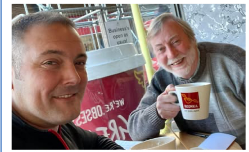
I recently met with the Snibston Heritage Trust and facilitated a meeting with LCC property to discuss ways of maintaining and improving the site.