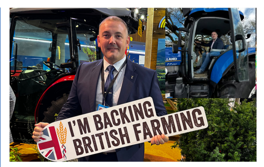
I have continued to support our local farming community, visiting farms in the area as well as joining the Melton protest & attending local farming group meetings