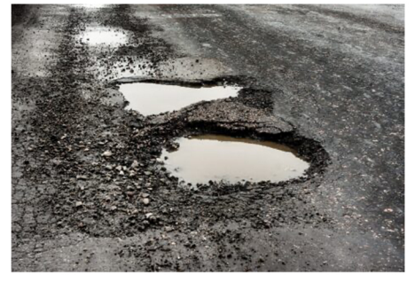
With funding being released by Gov to fix more potholes, I've gone on a mission to make sure Coalville gets its fair share of the cash.