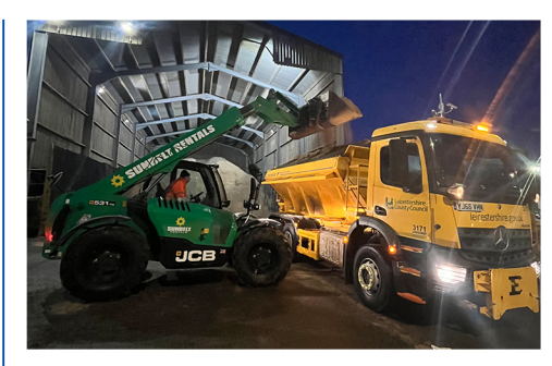
LCC gritting team did a Stirling job during the recent cold snap, getting all vehicle out across the county 24/7. Keeping our roads open and clear.