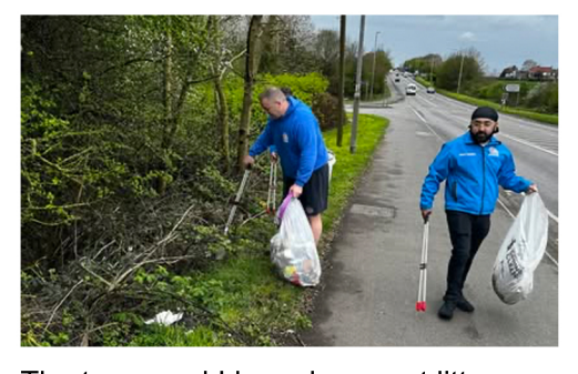
The team and I have been out litter picking again, we don't just do them, we organise them. If you would like to join in please message me, more the merrier.